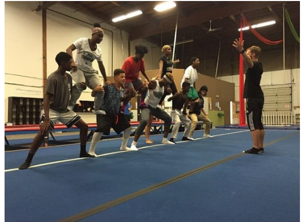
The RODA Program in action.

conversation and riotous play! It has given our coaches a wealth of new knowledge and techniques for working with youth who are at risk, including new ways to measure and evaluate the effectiveness of our programming. We will have the great pleasure of hosting a second training in later February with the same