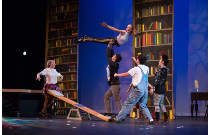
The teeter-board act during Acro-Biographies: Flipping the Page .

Cirrus Circus just put a wrap on their annual show! Acro-Biographies: Flipping the Page debuted on November 10 th at the Broadway Performance Hall, and this stunning production amazed us all. A quiet day of introspective study at the library turned into an unexpected celebration of stunning circus with juggling acrobatics, German and Cyr Wheels, anti-podism, and aerial silks and trapeze. Who knew such wonders existed in books?